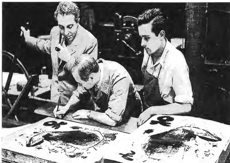
Joan Miro working on lithographs.